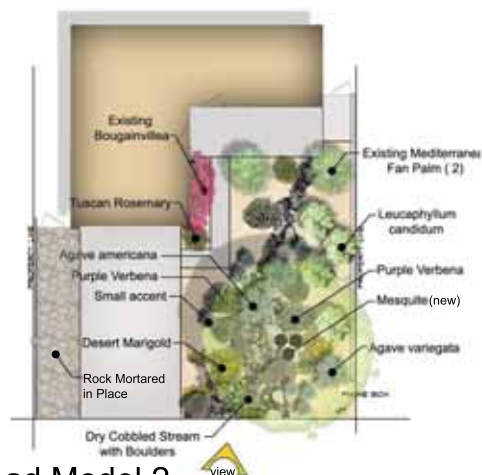
Overhead Model 2