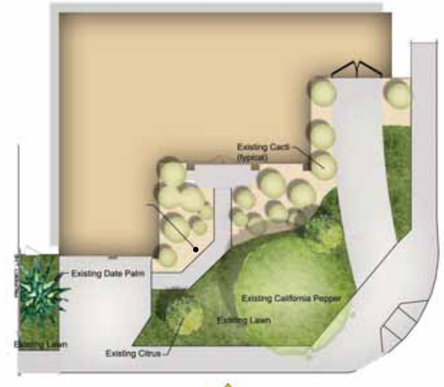
Overhead Model 3